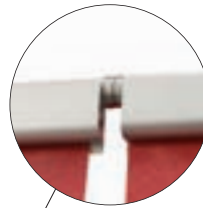
Expand's patented magnetic solution